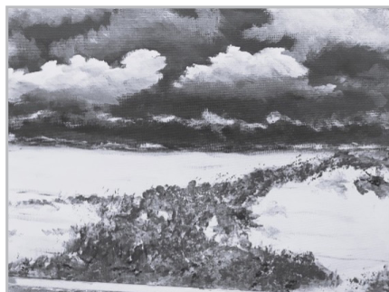
Sand dunes and sky in acrylics by Michael

We usually meet in the Village Hall on Mondays from 2pm-4pm. We don't meet on Bank Holidays. Our group has members of all abilities, using a variety of mediums. You might like sketching in pencil, charcoal, pen and ink, whatever. You can also paint in watercolour, acrylic or even oil or in a mixed media. Do whatever you like. We would love you join us.