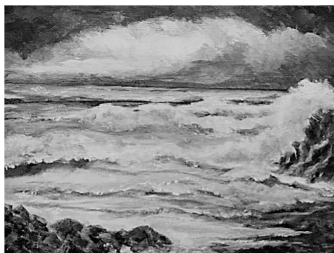
Moonlight seascape in acrylic by Michael. (Original in colour)

If you need it, several of our members will help and encourage you in whatever your artistic endeavours happen to be.